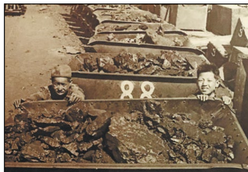
Children were among those used for forced labor at the Datong coal mine during the Japanese occupation of the city.

Japan's invasion, coal plunder, laborer enslavement, and postwar remembrance with immersive displays including reconstructed mass graves, survivor testimonies via holograms, interactive media, and excavated artifacts. There are more than 300 file photos and about 80 relics.